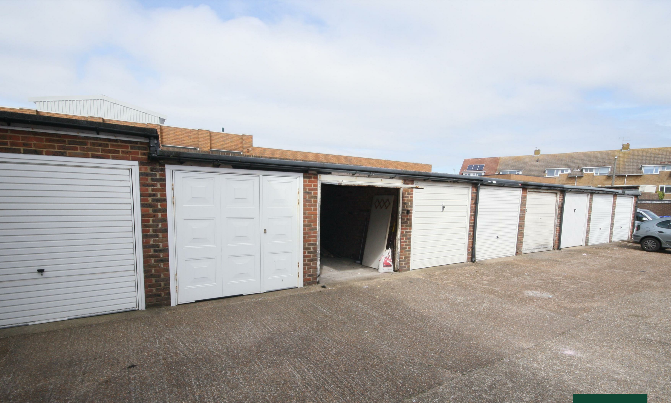
Garage 2, Princes Court Beach Green | | Shoreham-By-Sea LDN12 5VL